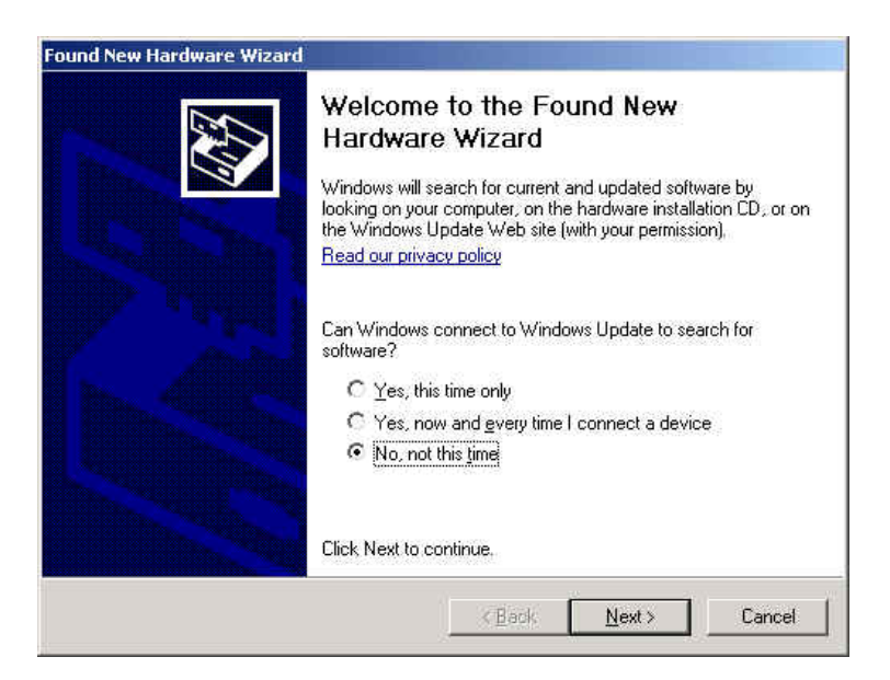
Figure 1: Found New Hardware Wizard

The driver package downloadable from the Support \rightarrow Software download page of <u>www.telegesis.com</u> should be unzipped into a local folder. When executing the file 'TgVCPInstaller.exe' prior to plugging in the ETRX2USB stick an installer will guide you through the steps required for the driver installation. If prompted that the driver has not passed the Windows logo test simply press 'Continue Anyway'.