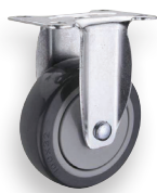
Polyurethane Medium Duty