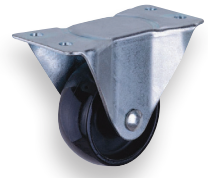
Plastic Low Profile