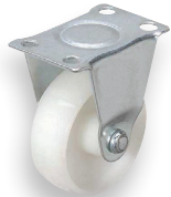
Nylon Medium Duty